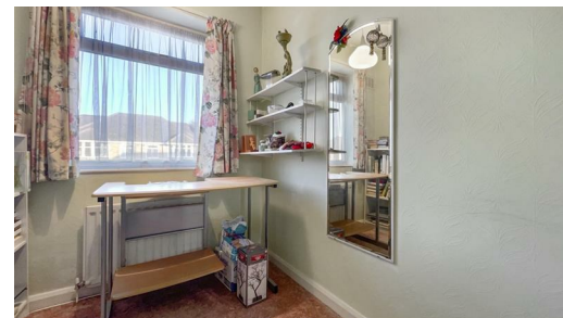
Bedroom 3 (front)