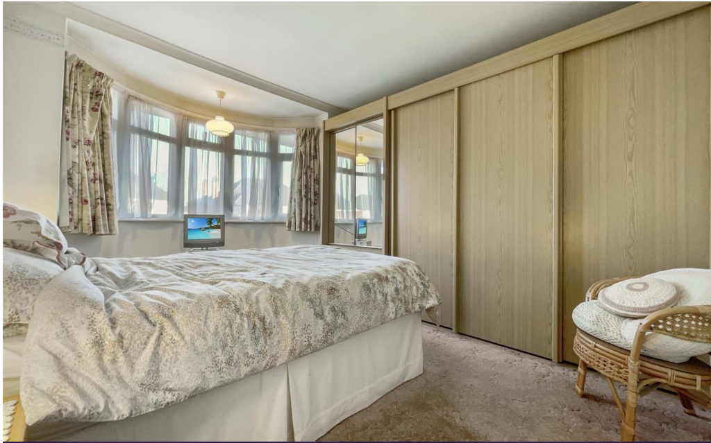
Bedroom 1 (front)