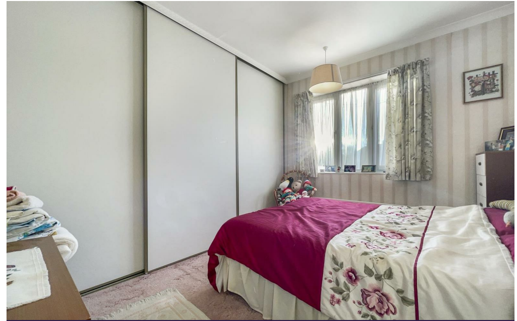
Bedroom 2 (rear)